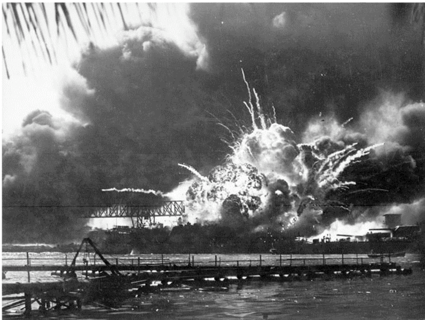
Japanese bombing of Pearl Harbor. December 7, 1941.